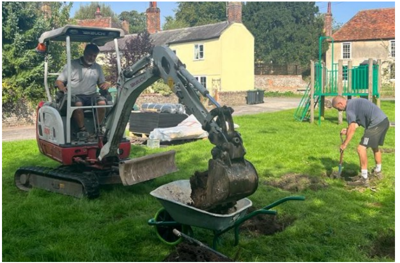
PICTURED: WICKSTEED CONTRACTORS BEGIN THEIR WORK IN THE BLAZING 'INDIAN SUMMER' HEAT OF EARLY SEPTEMBER.