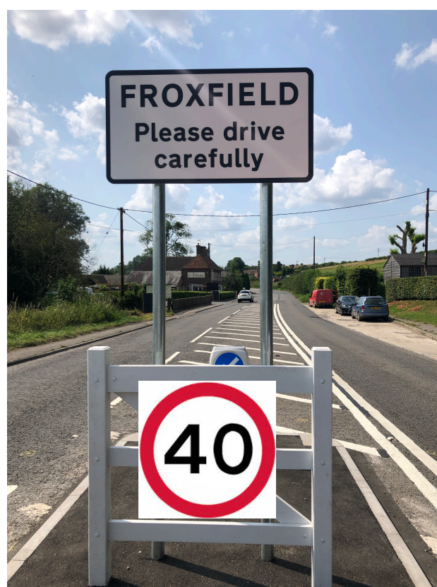
Artist's Impression - but soon should be a reality!

The standard 40mph speed limit will remove all ambiguity and ensure that all drivers understand that they are expected to drive with courtesy and regard the village boundaries as being the two gates. The PC will then seek to reinforce this message by fixing a Speed Indicator Device opposite Riverview. However, the next step will be for Wiltshire Council to publicly advertise the proposed change and fulfil some necessary legal steps. Anyone can comment on the proposed changes during the 28-day period of public consultation. Froxfield Parish Council hopes no one will object to lowering the speed limit and, all being well, and with no serious objections received, lowering the speed limit from 50mph to 40mph could be implemented early next year. This will be particularly beneficial to the cluster of houses at the end of