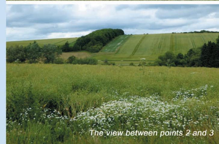
The view between points 2 and 3