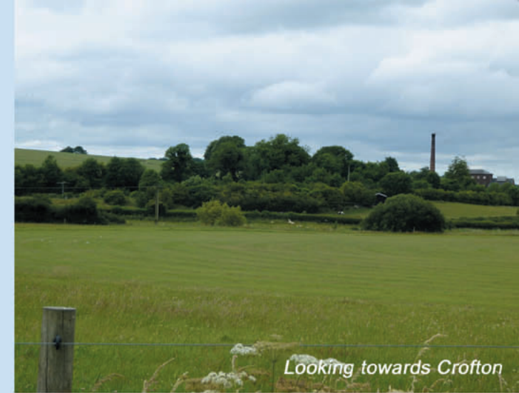
Looking towards Crofton

Make sure that you are suitably equipped for walking and note that these maps are intended as a guide only. Please respect the countryside, wildlife and livestock, and ensure that dogs are kept under effective control. Be aware that ticks are prevalent in the area.