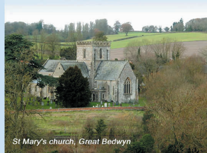
St Mary's church, Great Bedwyn