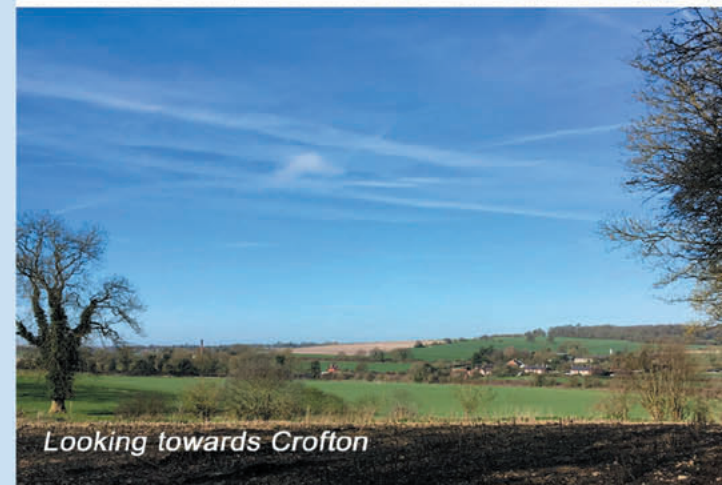
Looking towards Crofton

Make sure that you are suitably equipped for walking and note that these maps are intended as a guide only. Please respect the countryside, wildlife and livestock. Be aware that ticks are prevalent in the area.